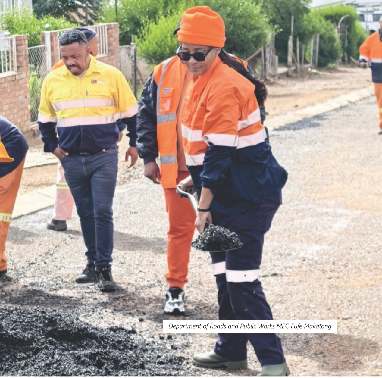
Department of Roads and Public Works MEC Fufe Makatong

The intervention forms part of the Department's broader effort to maintain road infrastructure, enhance road safety, and strengthen connectivity for communities while supporting local economic activity. Operation Vala Zonke continues to demonstrate government in action, taking services to the people and building stronger, safer and more connected communities.