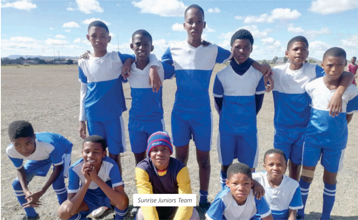
Sunrise Juniors Team