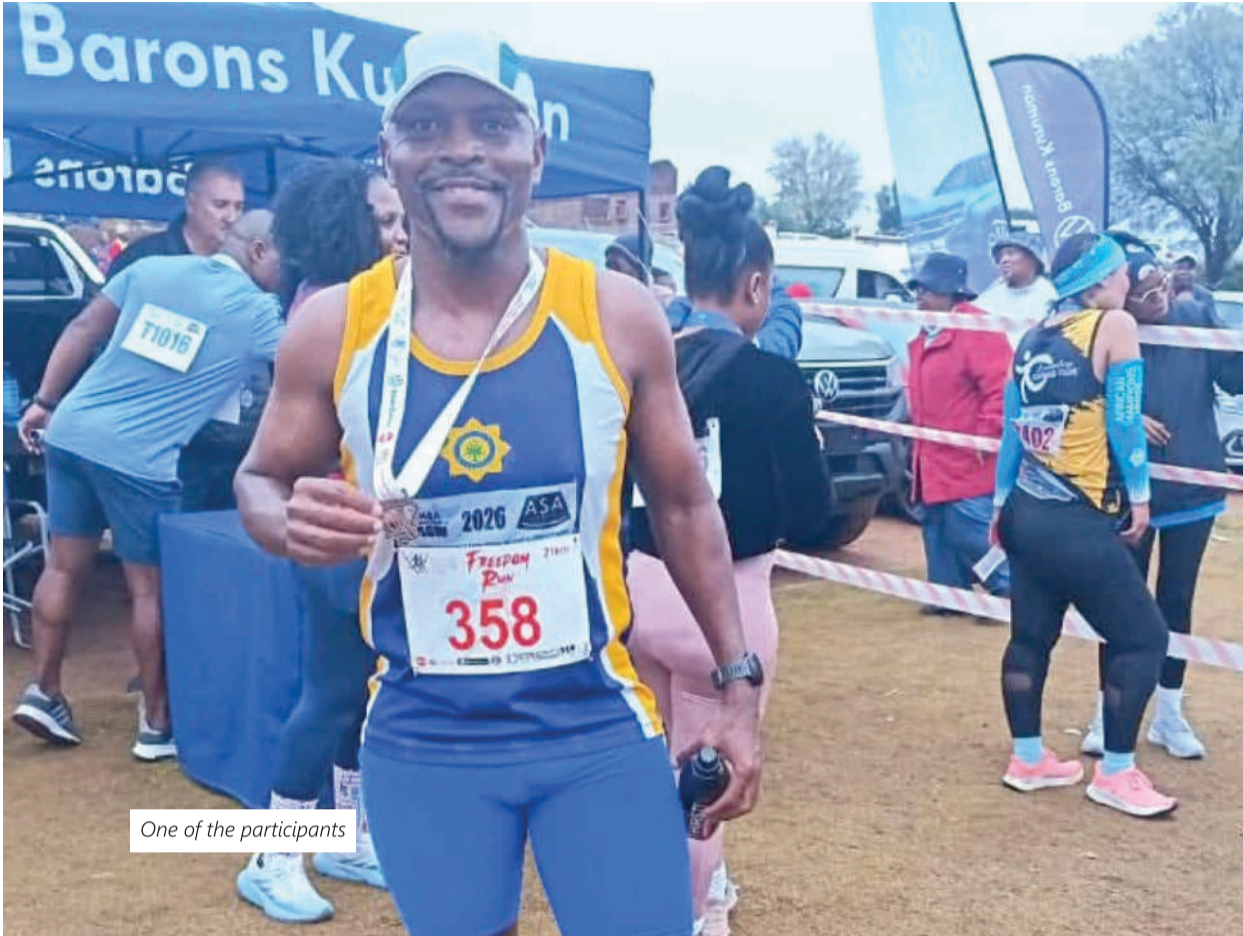
One of the participants